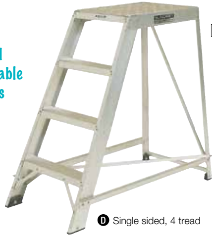
D Single sided, 4 tread

Single and double sided steps available in 7 heights