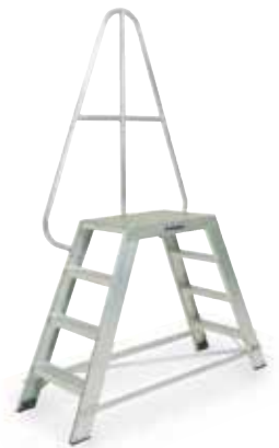
E Double-sided 4 tread steps, with handrail to one side