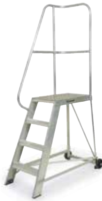
E Single-sided 4 tread, with left side ascending and rear handrail, and wheels