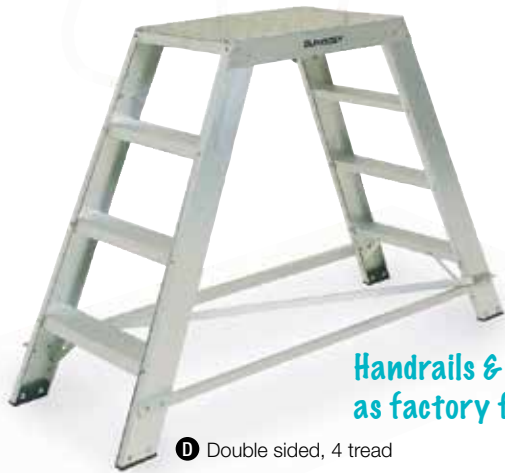
D Double sided, 4 tread

Single and double sided steps available in 7 heights