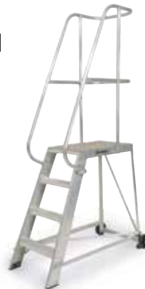
E Single-sided 4 tread, with handrail to both sides and rear, and wheels