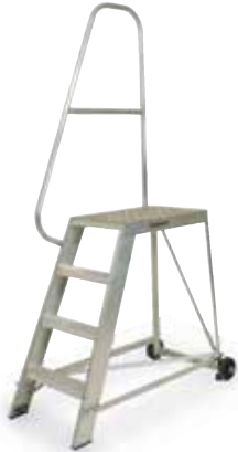
E Single-sided 4 tread, with left side ascending handrail and wheels